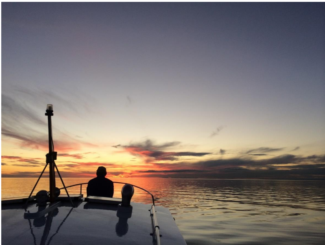
Roll on summer - Lola on a dead flat bay