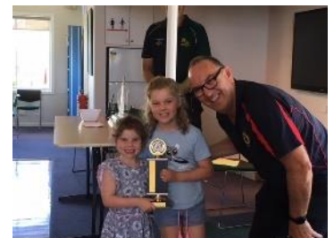
Top crew – Sunday Antics

The trophies spanned the many regattas during the year. The Summer Series, Winter series, twilight series and Thursday afternoon winter Terror series.