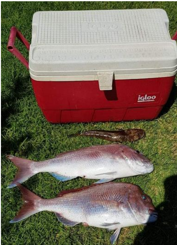
Fulvio caught these in the middle of the day!

Here's some inspiration for the club fishermen!