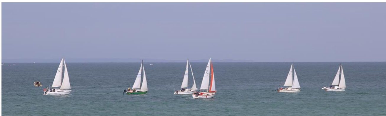
Racing start 14.11.18